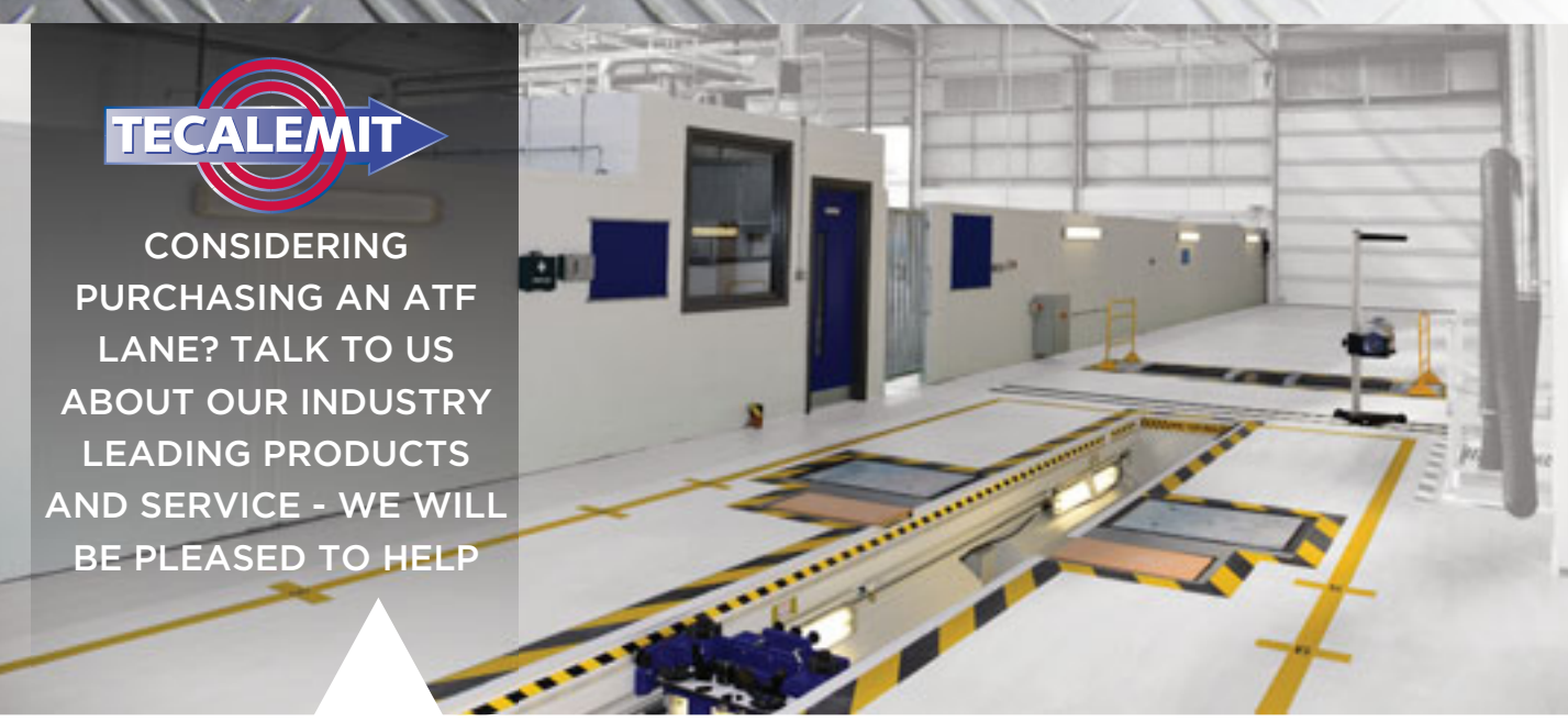
TECALEMIT ATF Lane